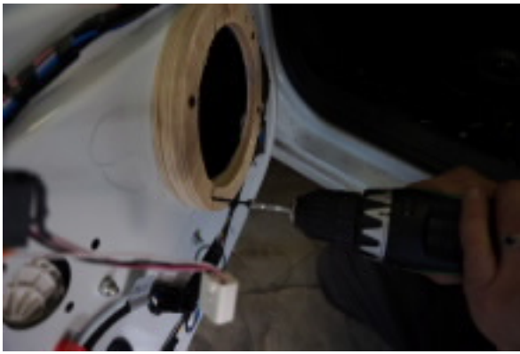
7. (3,5*32 )