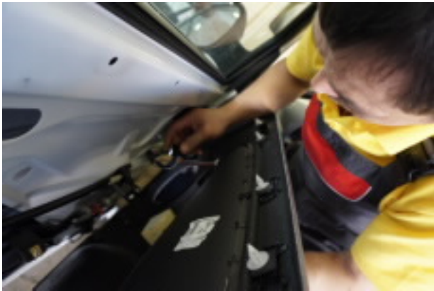
8. FOX SOFTWARE